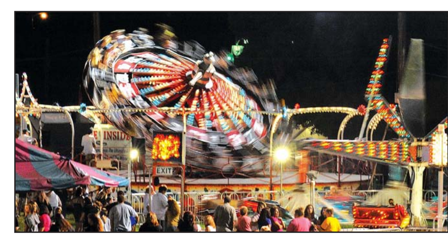
Colorful rides (above) turn through the skies on the first night of the Mannington District Fair. The swing ride (below) for kids and adults offers a fast ride around the fair.