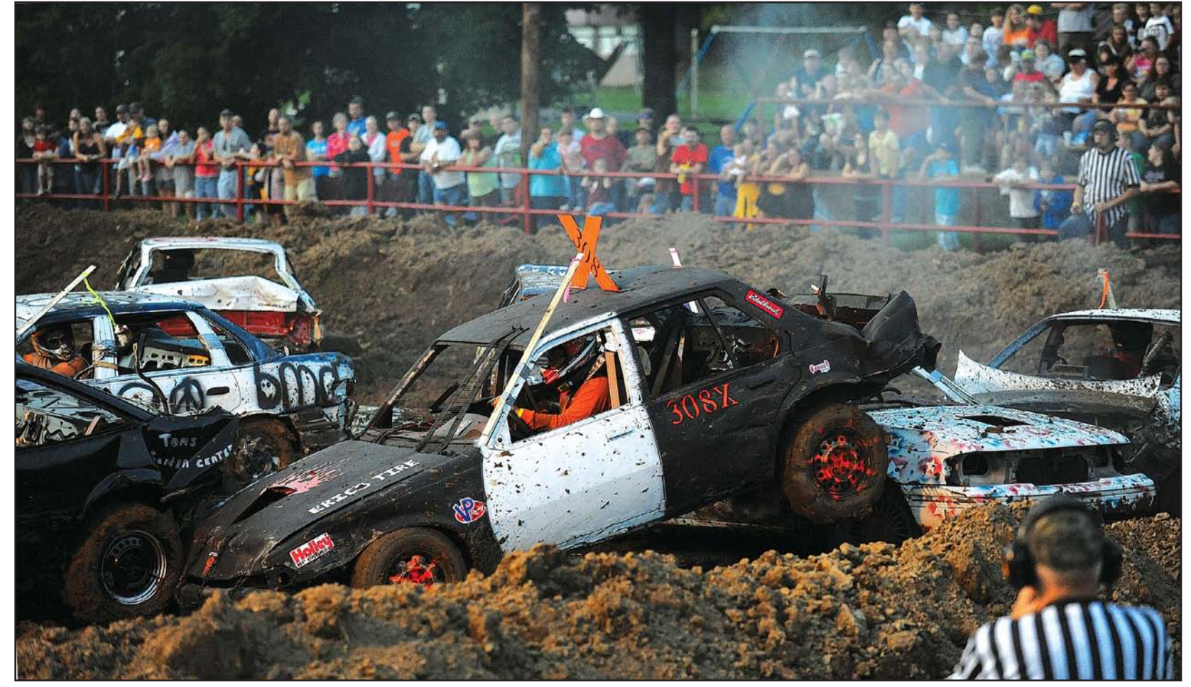
A demolition derby driver of gets jacked up in 4 cylinder race at the 2009 Mannington District Fair, which ran from Aug. 3-8 at Huff Park. The week's activities opened Monday with a steer and heifer show, Junior Miss Mannington and Mannington District Fair Queen crownings, magic show, demolition derby, horse show, tractor pull contest, greased pig contest, horse pulling contest, strong man competition, lawnmower races and live entertainment.